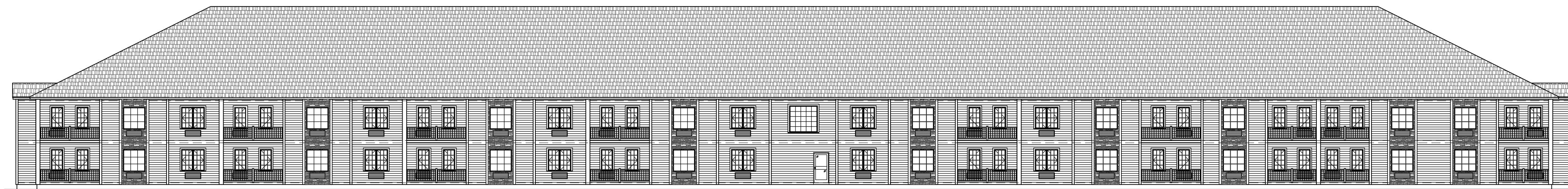
2 EXTERIOR ELEVATION - SOUTH A3.1 SCALE: 1/16" = 1'-0"