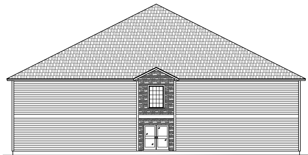
3 EXTERIOR ELEVATION - WEST A3.1 SCALE: 1/16" = 1'-0"